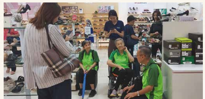
Seniors Day Out at Metro Causeway Point, supporting elderly beneficiaries through community engagement activities