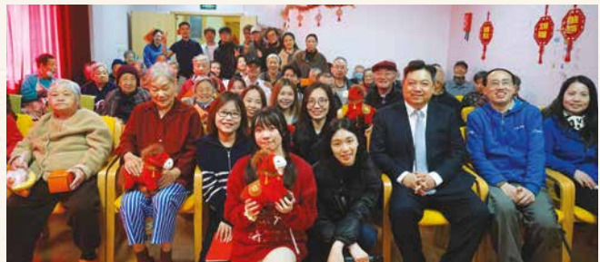
Community outreach activities at Xujiahui Subdistrict Elderly Care Home, supporting elderly residents through volunteer services and donations

During the year, Metro continued its longstanding support for the Xujiahui Subdistrict Elderly Care Home (徐家汇街道敬老院) through multiple outreach initiatives, including festive visits and seasonal welfare activities. Volunteers, together with tenant partners, provided services and distributed daily necessities, reinforcing Metro's commitment to caring for the elderly in the community.