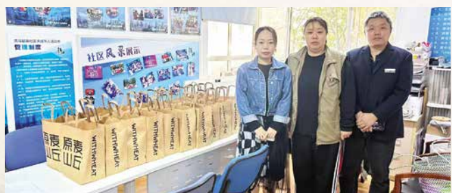
Volunteers visiting elderly residents in the community during Chongyang Festival, supporting beneficiaries through care packages and outreach activities

During the year, Metro carried out community outreach initiatives in collaboration with local partners, including festive visits to elderly residents within the community. In conjunction with the Chongyang Festival, volunteers visited senior residents and individuals living alone, distributing care packages and extending support as part of efforts to promote social inclusion and community wellbeing.