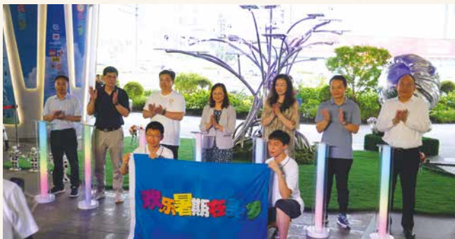
"Happy Summer in Metro" community event in Xuhui District, supporting youth engagement and education initiatives

In July 2025, Metro launched the 26th edition of the "Happy Summer in Metro" community event in partnership with the Xuhui District authorities, marking the continuation of a long-standing initiative to support youth engagement. As part of the programme, Metro renewed its commitment to education through scholarships and collaborative initiatives benefiting students in the district.