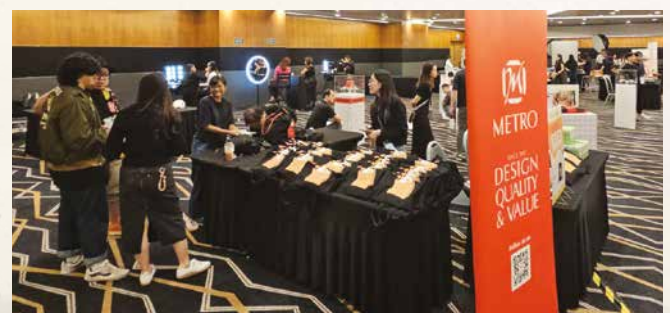
Engagement with students at Singapore Management University and Singapore University of Social Sciences through workshops on retail and professional development