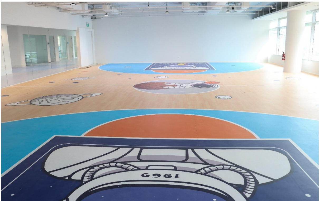
Sports hall in DIMENSIONS's new Tampines Campus at Asia Green