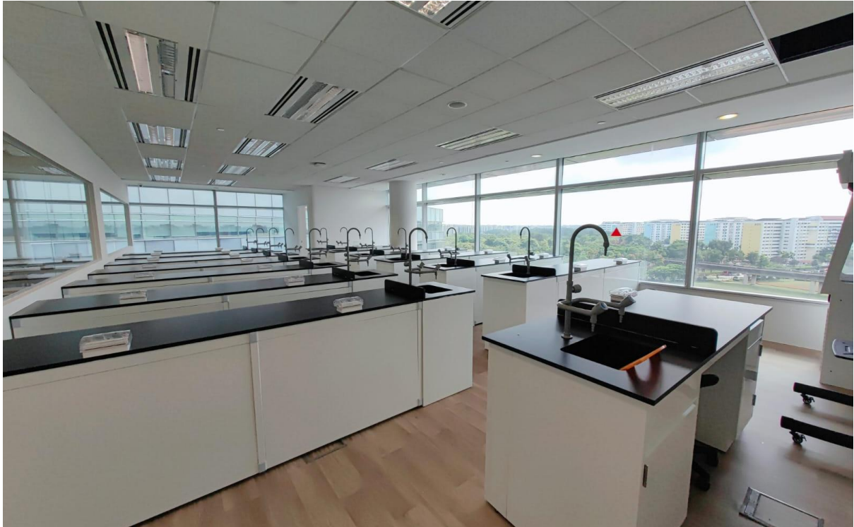
Science laboratory in DIMENSIONS's new Tampines Campus at Asia Green