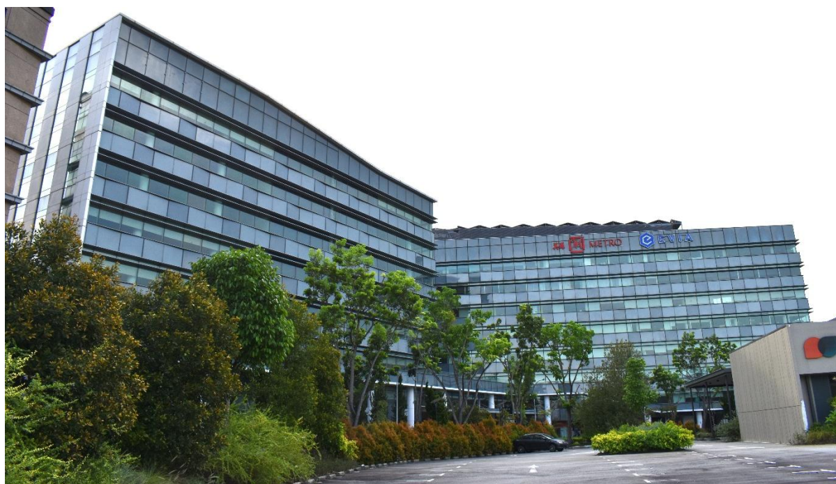
Exterior of Asia Green

Singapore, 7 May 2025 – Mainboard-listed Metro Holdings Limited (“ Metro ” or the “ Group ”) (“美罗控股有限公司”), a property investment and development group backed by established retail operations, announces positive leasing progress achieved for its 50%-owned Asia Green property (“ Asia Green ” or the “ Property ”) in Singapore.