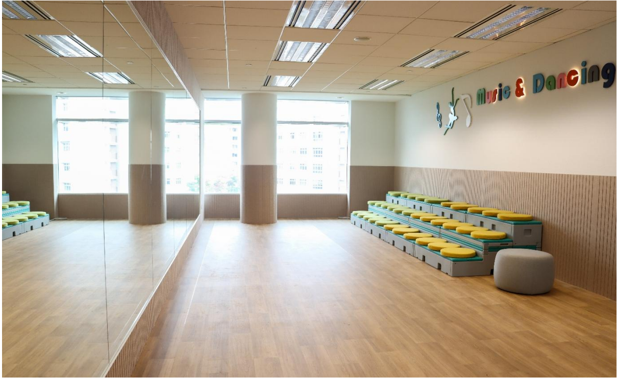
Music and Dance room in DIMENSIONS's new Tampines Campus at Asia Green