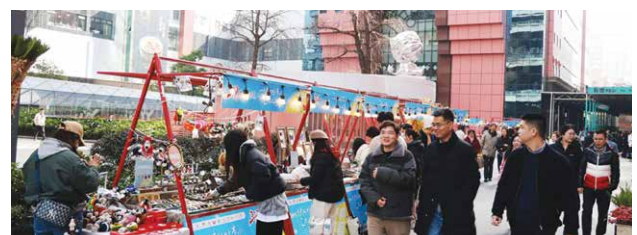
Charity bazaar at Metro City

To contribute to the welfare of frontline workers like delivery staff and cleaners, Metro collaborated with the Xuhui District Federation of Trade Unions on a mobile refreshment kiosk that provided complimentary cool refreshments to frontline workers during the summer. Metro also partnered with the Shanghai City Charity Fund's Xuhui District representative office to organise a week-long outdoor charity bazaar at Metro City in January 2024.