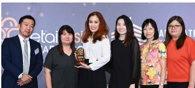
Metro recognised for Best Efforts in Corporate Social Responsibility (Retail) at the SRA Retail Awards Gala Dinner 2023

For our efforts in community engagement and corporate social responsibility, Metro (Private) Limited ("Metro Singapore") was recognised with an award for Best