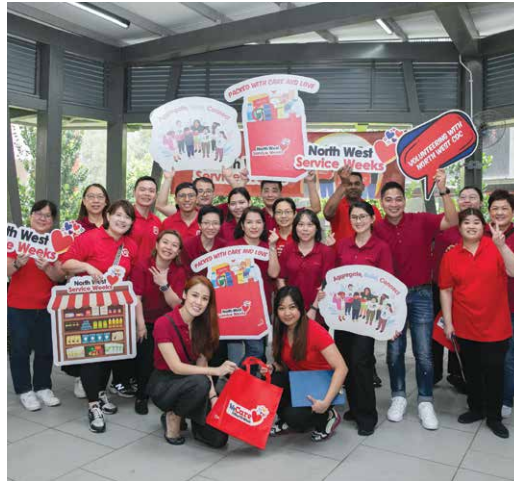
Metro volunteers at FFTH's warehouse and FFTH's Annual Toy Buffet