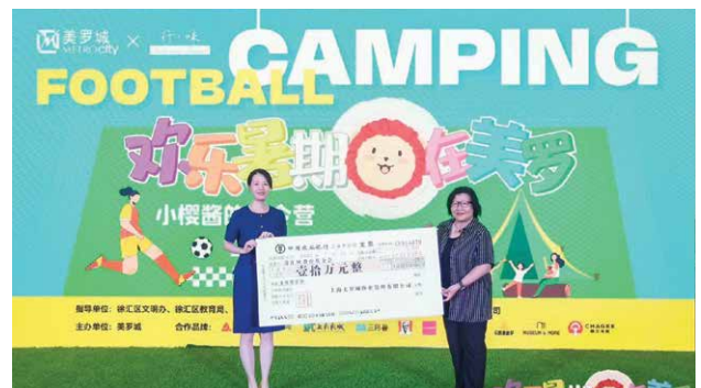
"Happy Summer in Metro" event

Since 1999, Metro and the Shanghai Xuhui District have hosted the annual "Happy Summer in Metro" community event, which returned for its 24th edition in July 2023, after a brief break in 2022 due to COVID-19 restrictions. The three-day event featured interesting summer activities ranging from open-air cinema screenings to games and outdoor camping. As part of this event, Shanghai Metro also continued with its yearly donation of RMB100,000 to the Shanghai Xuhui District Education Development