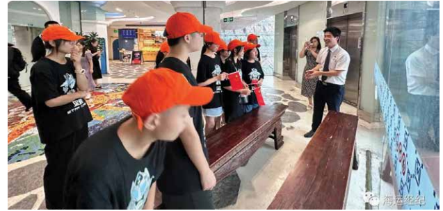
Summer camp visit to Metro City for teachers and students from Tongjiang County

In August 2023, Metro donated RMB53,000 in support of a summer camp held for teachers and students from the impoverished regions of Tongjiang County in the