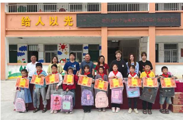
Visit by Metro volunteers to the Shanghai Metro Hope School

In September 2023, six members from the Shanghai Metro team resumed Metro's first post-pandemic physical visit to the Shanghai Metro Hope School in Feng Yang County of Anhui Province, bringing with them donations of new school uniforms, school bags and other educational supplies worth RMB12,000, and marking a joyous, long-awaited meetup with the students there.