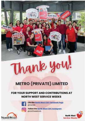
Appreciation from North West CDC for Metro's participation in North West Service Weeks

In behalf of North West CDC, I would like to express my deepest appreciation for the support from you & your team of volunteers which led to yet another successful North West Service Weeks!