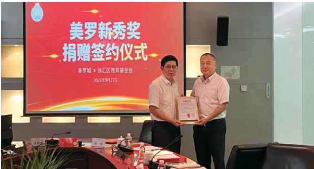
Launch ceremony for the Metro Teacher Research Scholarship

In September 2023, Metro formally launched our collaboration with the Xuhui District Education Fund on the Metro Teacher Research Scholarship programme. We made our first donation of RMB300,000 per year to this programme which supports young teachers from the Xuhui District engaging in educational research.